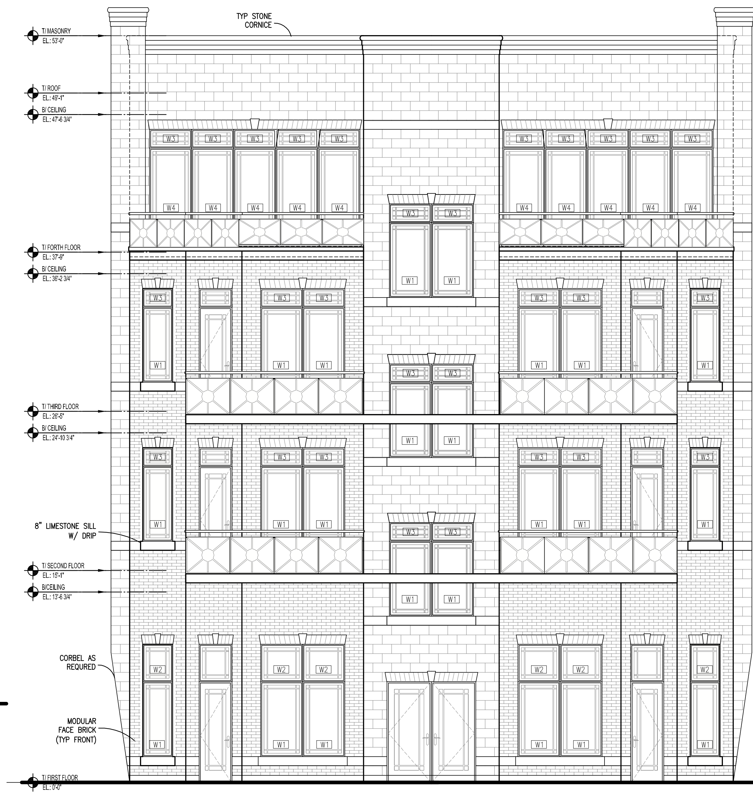
FRONT ELEVATION SCALE: 1/4" = 1'-0" 0 4 8